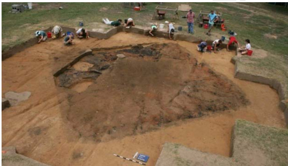
Archaeologists studying a ceremonial mound in a Native American town called Joara discovered an inland fort built by a Spanish expedition in the New World near present-day Morganton, North Carolina