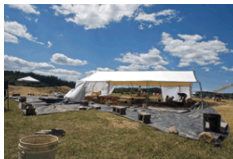
The Berry site, where archaeologists have been excavating since 2001, is the only known outpost from the expeditions of Spanish captain Juan Pardo, who followed the route established decades earlier by explorer Hernando de Soto.

It's early in the hills of western North Carolina and the mist is just starting to burn away. I follow a winding dirt road surrounded by Christmas trees--raised here for shipment all over the country--and then veer off to the site of a 16th-century European outpost far from the coast, only miles from where my English ancestors settled hundreds of years later. Not much larger than a baseball diamond, it is the earliest inland European settlement discovered in the southeastern United States. But it's not English. It's Spanish, and in a place that, until recently, few thought they had reached.