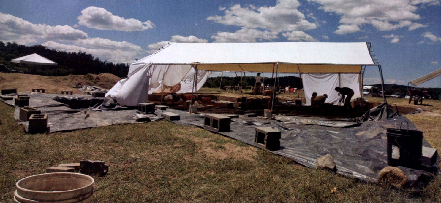
The Berry site, where archaeologists have been excavating since 2001, is the only known outpost from the expeditions of Spanish captain Juan Pardo, who followed the route established decades earlier by explorer Hernando de Soto.

rior with 125 men, ordering him to find a route west, “pacify” the natives, spread Christianity, and bring vast regions (from present-day Canada to Mexico) under Spanish rule, cutting off the ambitions of Europe’s other colonial powers.