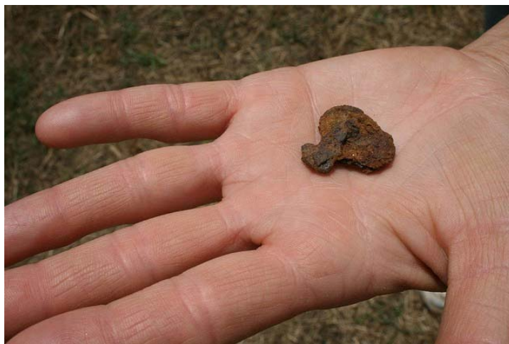
A Spanish clothing hook found at the site

San Juan was the first and largest garrisons founded by Pardo. He was trying to colonise the American South and was looking for gold. However, he never found it, despite there being an abundance of gold that was eventually found by settlers in the early 1800s.