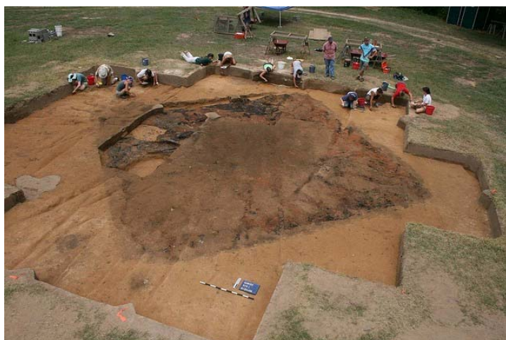
Earliest European fort in US discovered (University of Michigan)

The earliest European fort ever found in the US has been discovered in the Appalachian Mountains.