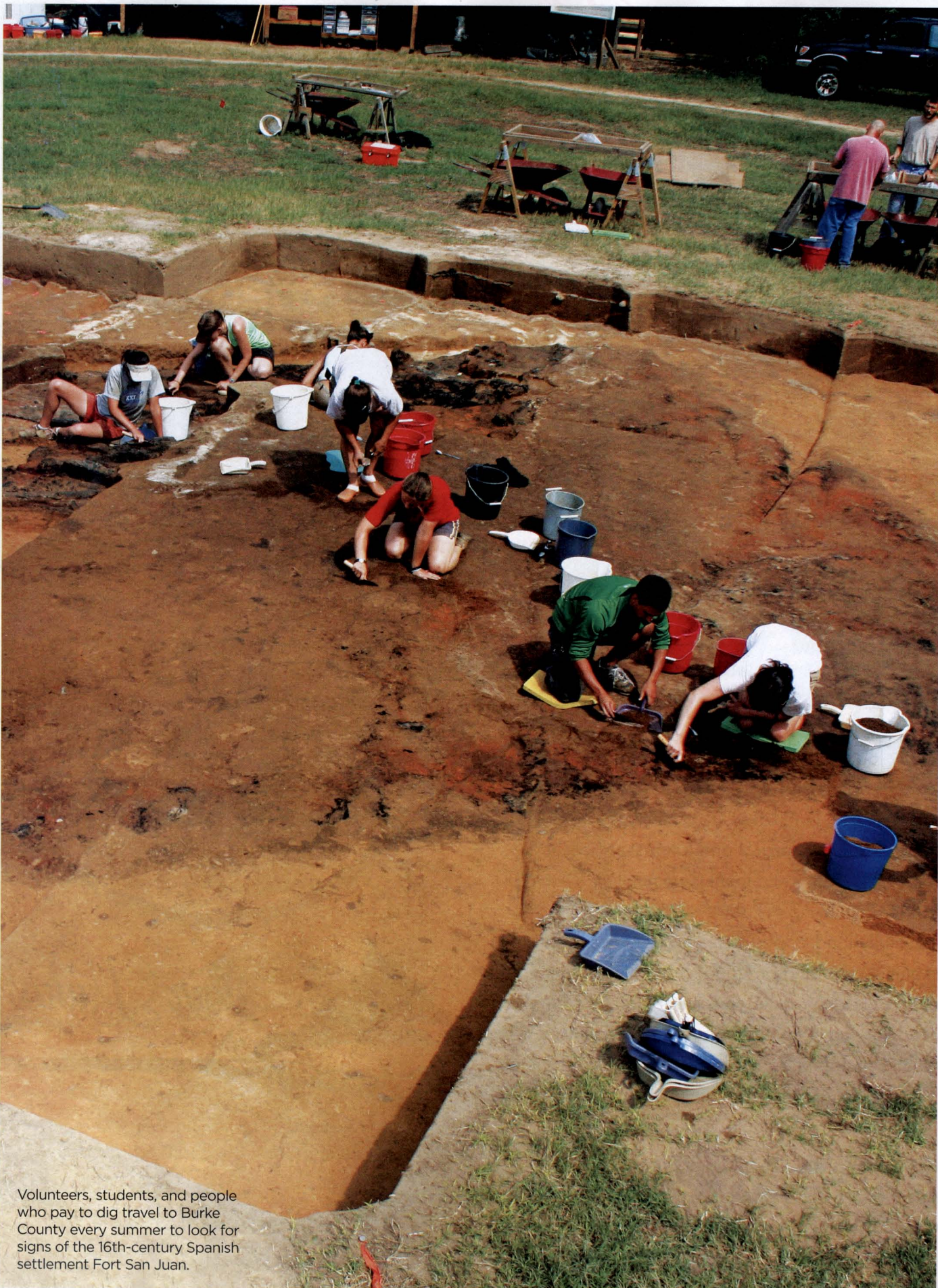
Volunteers, students, and people who pay to dig travel to Burke County every summer to look for signs of the 16th-century Spanish settlement Fort San Juan.