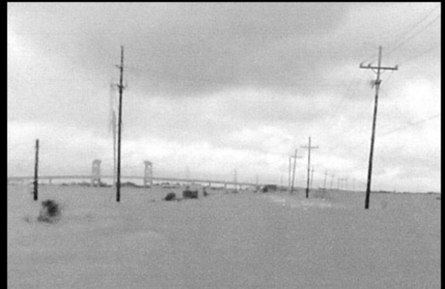
LA1 Underwater, June 2003