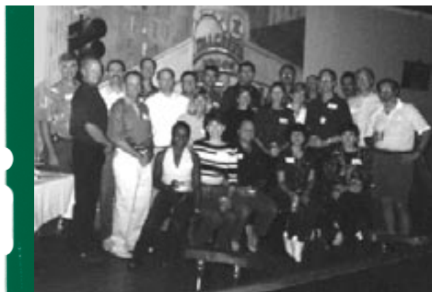
The Classes of '77, '78 and '79 reunite at Rock 'n Bowl in Mid City

The weekend was chock full of class reunions scattered all over New Orleans.