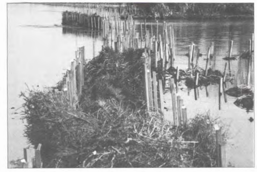
Recycled Christmas trees rest in cribs. This community service project helps maintain the wetlands.