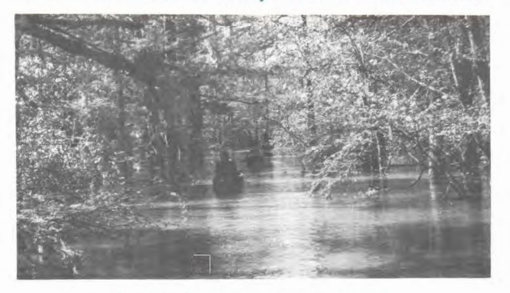
Begins At Tulane Law School