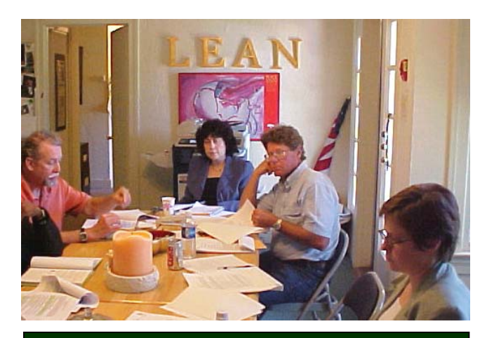
Members of Louisiana Environmental Action Network at a meeting with EPA officials

To provide the best practical educational experience for its students, the Clinic generally operates at full capacity. Consistent with its "client driven" mission, the Clinic evaluates potential new matters primarily on a "first-come, first-served" basis. The Clinic seeks to accept educationally worthwhile cases where the client is not reasonably able to obtain representation from the private bar. Before accepting a new case, the Clinic submits it to a Legal Advisory Board (listed on the next page) for review and approval.