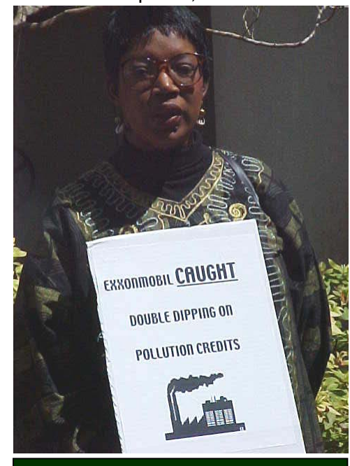
Client at press conference

Notice of Louisiana Environmental Action Network re: EPA's failure to discharge its mandatory duty to review emission standards for hazardous air pollutants from process vents (40 C.F.R. § 63.113) under Clean Air Act § 112(d) (Seeking EPA revision of a regulation that allows facilities to continue to rely on inadequate flare technology despite the fact that current boilers, process heaters, and incinerators have destruction efficiencies greater than 99%.) (March 31, 2003)