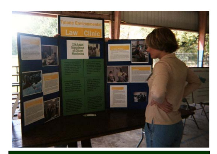
The Tulane Environmental Law Clinic's display at the Community Monitoring Fair in New Sarpy, LA